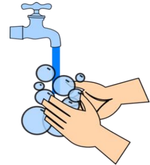
wash your hands all over, being sure to clean in between fingers, under fingernails, around wrists and both the palms and backs of hands