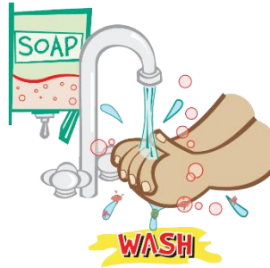
cover your hands with soap and rub your hands vigorously