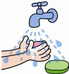
Rinse your hands thoroughly to remove all soap and germs