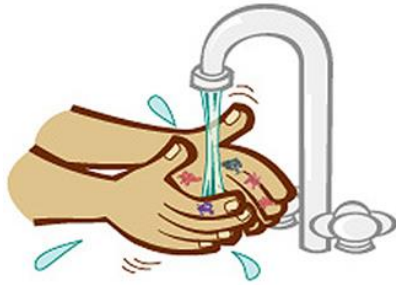
wet your hands with running water