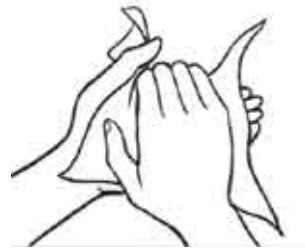
use a paper towel to dry hands & turn off the tap